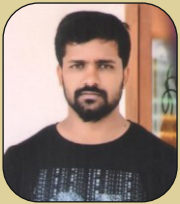
Guruprasada C.A. SDA