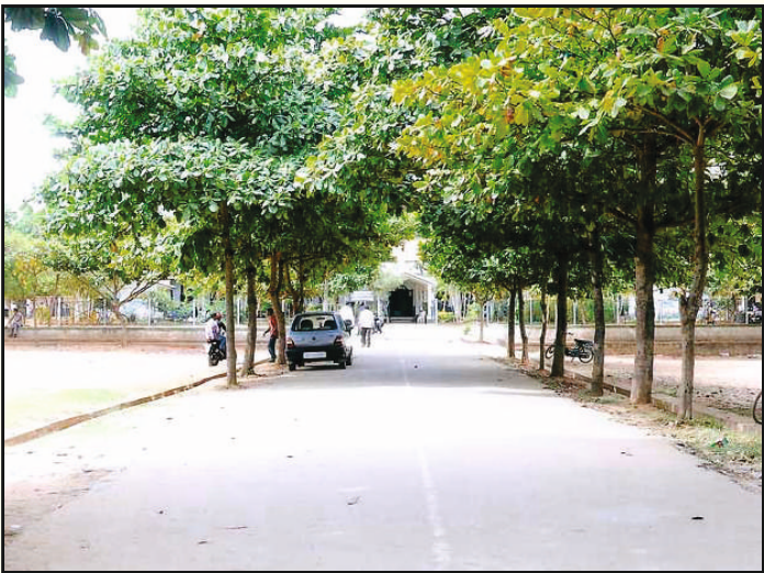
Our Eco-friendly Campus