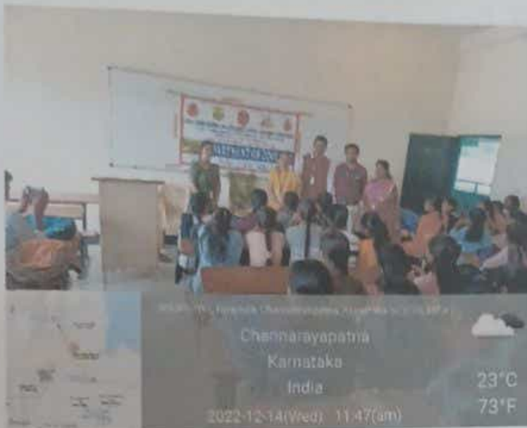
Channarayapatna Karnataka India 2022-12-14(Wed) 11:47(am) 23°C 73°F