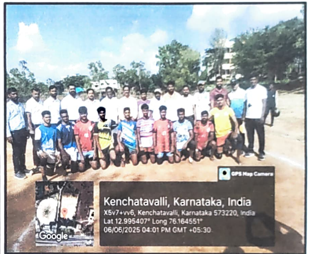
Physical Education Director Sri Adichunchanagiri First Grade College Channarayana-573116