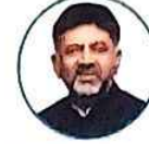
Shri. DK Shivakumar Hon'ble Deputy Chief Minister Government of Karnataka