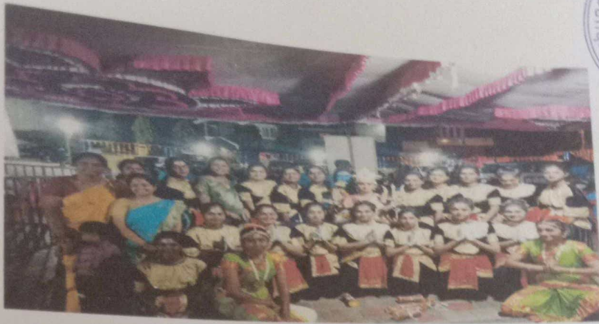
Cultural Performance : Golden Coronation