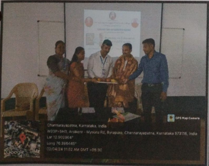
Channarayapatna, Karnataka, India W93P+5H3, Arakere - Mysuru Rd, Byrapura, Channarayapatna, Karnataka 573116, India Lat 12.902864° Long 76.386445° 02/04/24 11:52 AM GMT +05:30