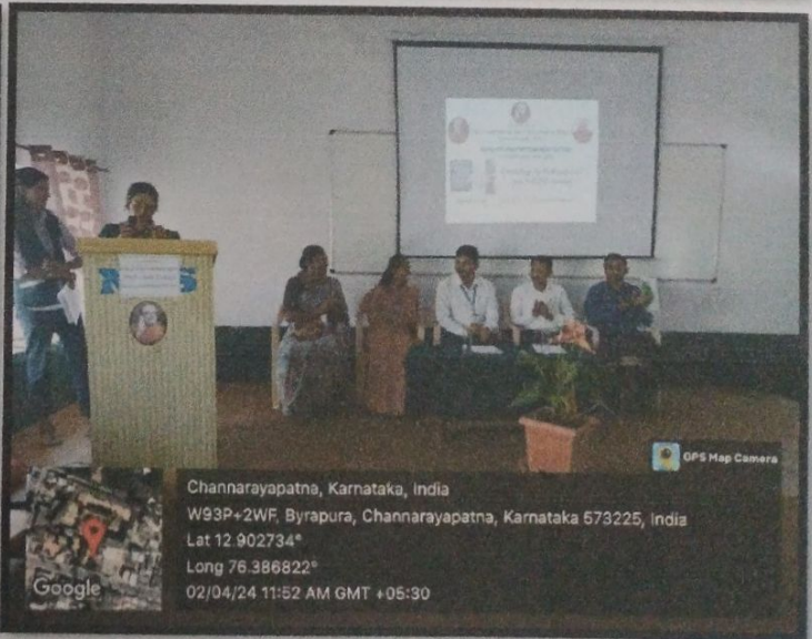
Channarayapatna, Karnataka, India W93P+2WF, Byrapura, Channarayapatna, Karnataka 573225, India Lat 12.902734° Long 76.386822° 02/04/24 11:52 AM GMT +05:30