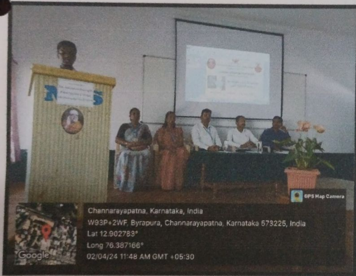
Channarayapatna, Karnataka, India W93P+2WF, Byrapura, Channarayapatna, Karnataka 573225, India Lat 12.902783° Long 76.387166° 02/04/24 11:48 AM GMT +05:30