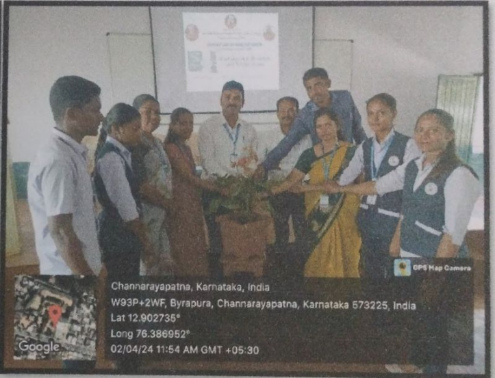
Channarayapatna, Karnataka, India W93P+2WF, Byrapura, Channarayapatna, Karnataka 573225, India Lat 12.902736° Long 76.386952° 02/04/24 11:54 AM GMT +05:30